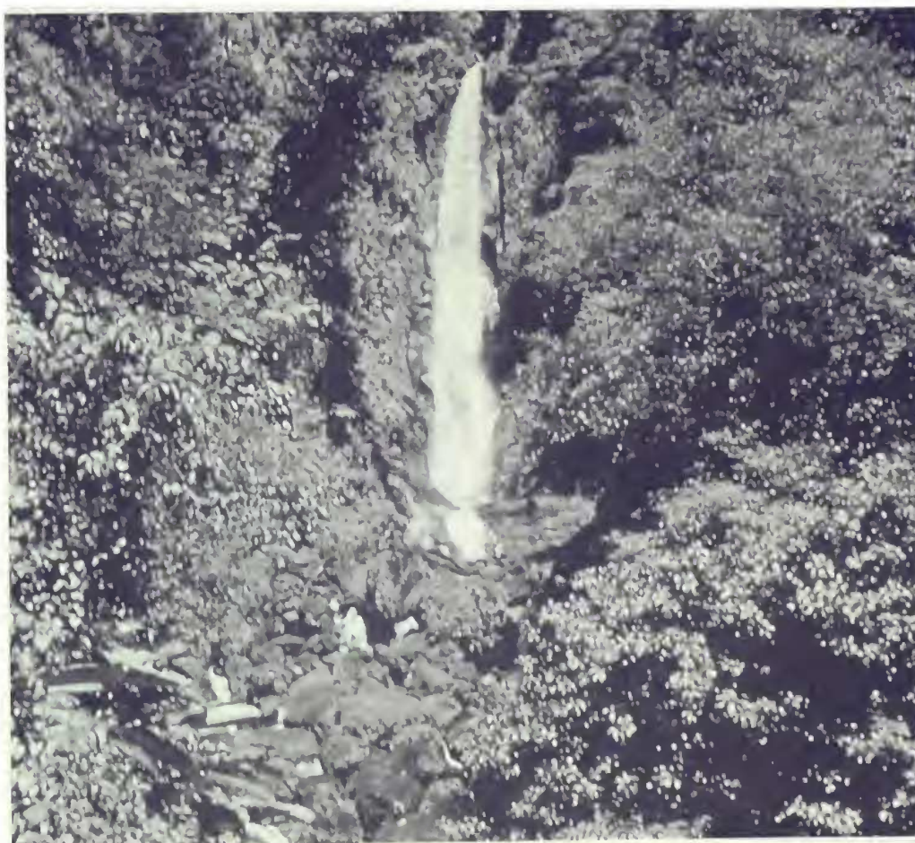
Figure 3. Trafalgar Falls, 4 miles [6.5 kilometers] northeast of Roseau, St. George Parish, Dominica. The elevation is 1000 feet [=305 meters].

Reproductive data, collected during part of the spring dry season and also in the wet season of summer, are tabulated in Table 5. In addition to the data presented in Table 5, a female taken on March 24, 1964, was pregnant as were single females obtained on April 1, April 6, and April 16 in the same year. Two females collected on January 31 and six collected in late November and early December revealed no gross reproductive activity. These reproductive data appear